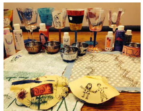
KBE students created Judaica for their Ritual Objects project.